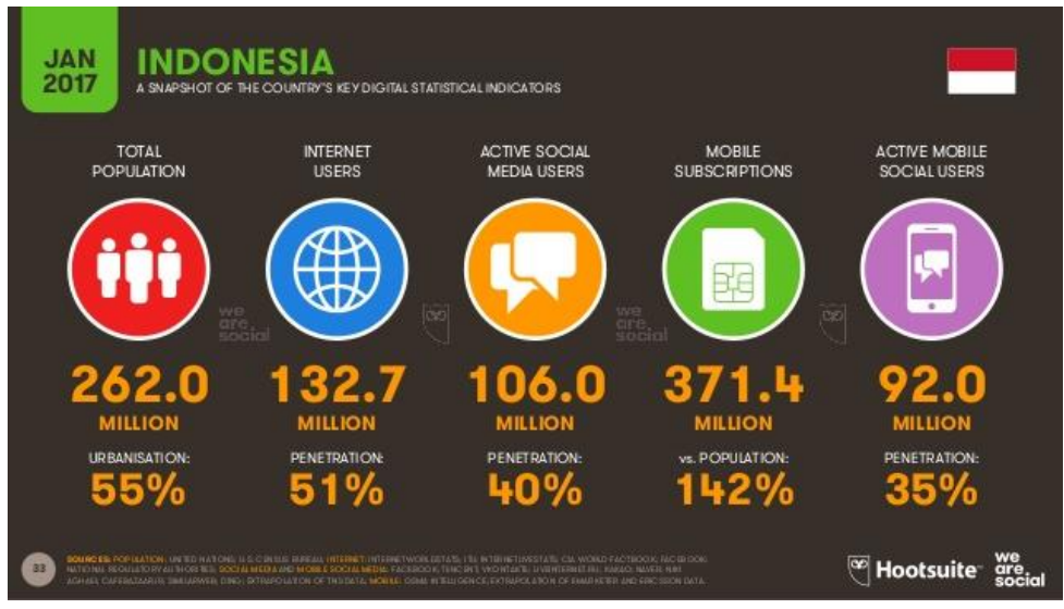
Figure 2. Indonesia Statistical Indicators