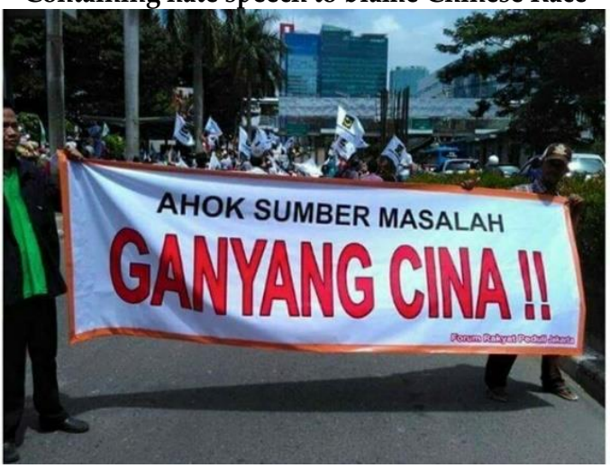
Picture 1. The demonstration during Jakarta Gubernatorial Election Containing hate speech to blame Chinese Race